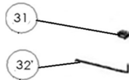
LUZ LED TGRV-S LED LIGHT TGRV-S